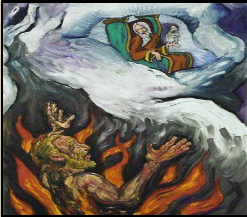
The Rich Man and Lazarus (Luke 16)