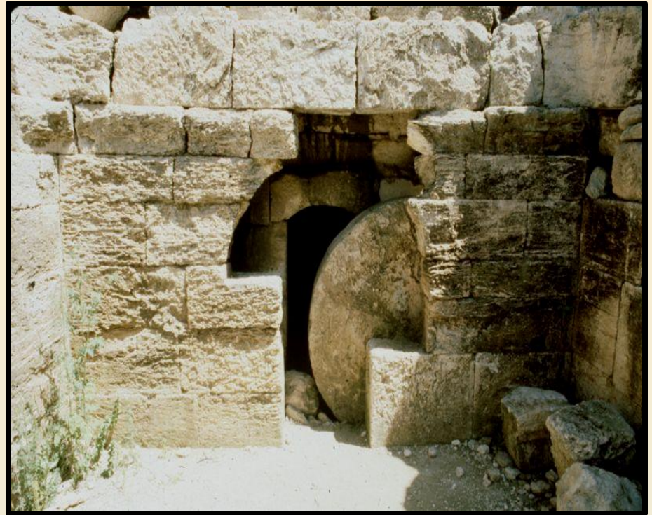
The Raising of Lazarus (John 11 & 12)

“If they do not hear Moses and the prophets, neither will they be persuaded, though one rises from the dead.” (Luke 16:31)